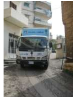
T.E.R.R.E. Liban pick up collects paper waste