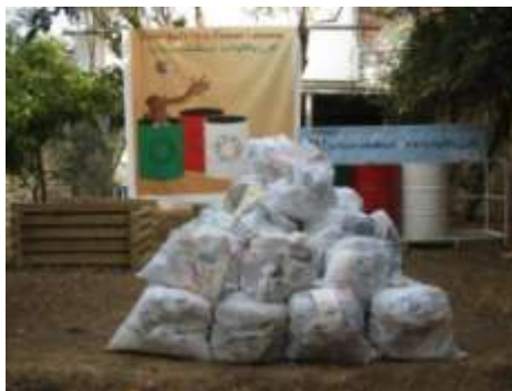
Storage area of 4m 2