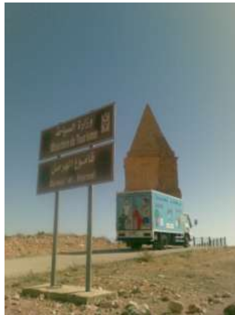
T.E.R.R.E. Liban truck collecting paper waste from in Hermel - Bekaa