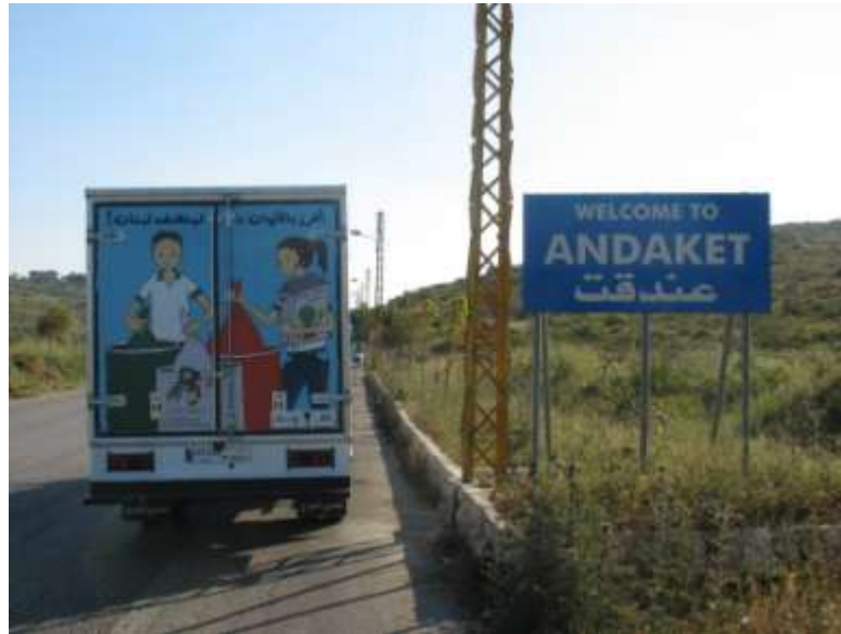
T.E.R.R.E. Liban truck collecting paper waste from Andket - Akkar caza