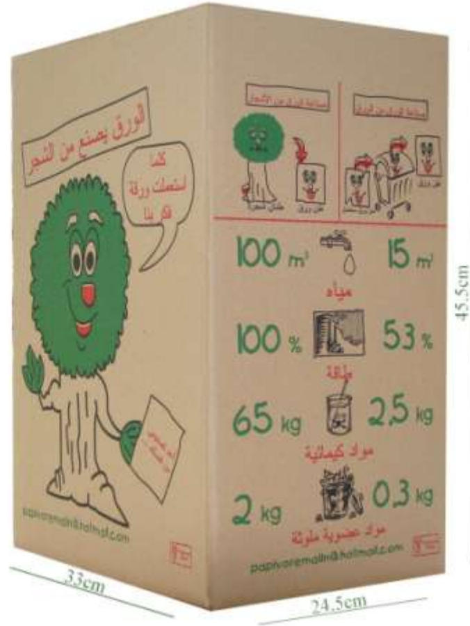
“Papivore Malin” box